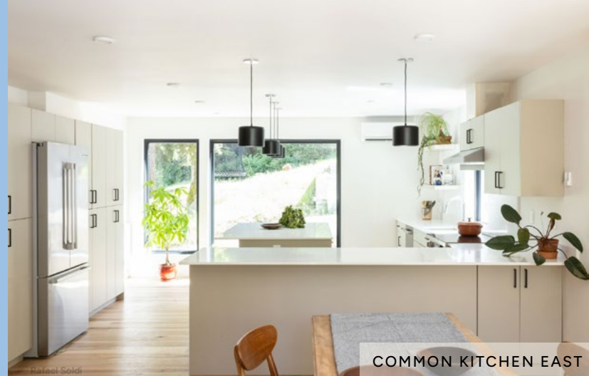
COMMON KITCHEN EAST