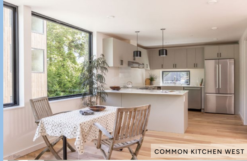
COMMON KITCHEN WEST