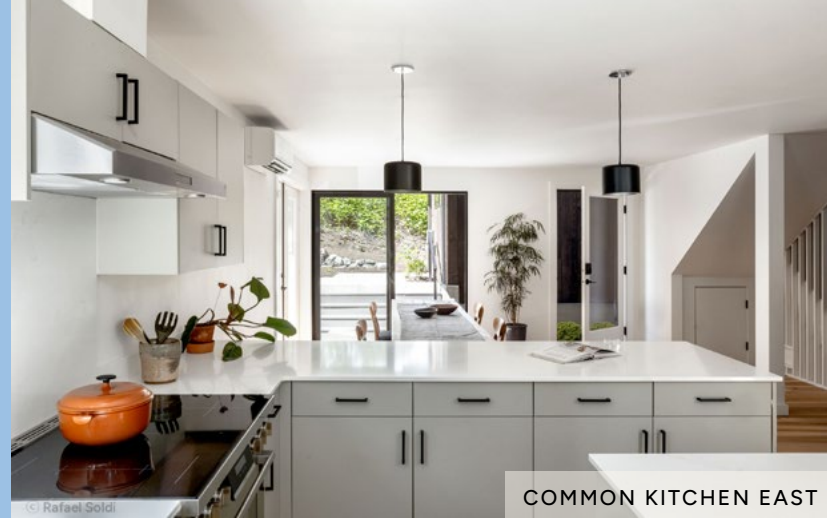
COMMON KITCHEN EAST